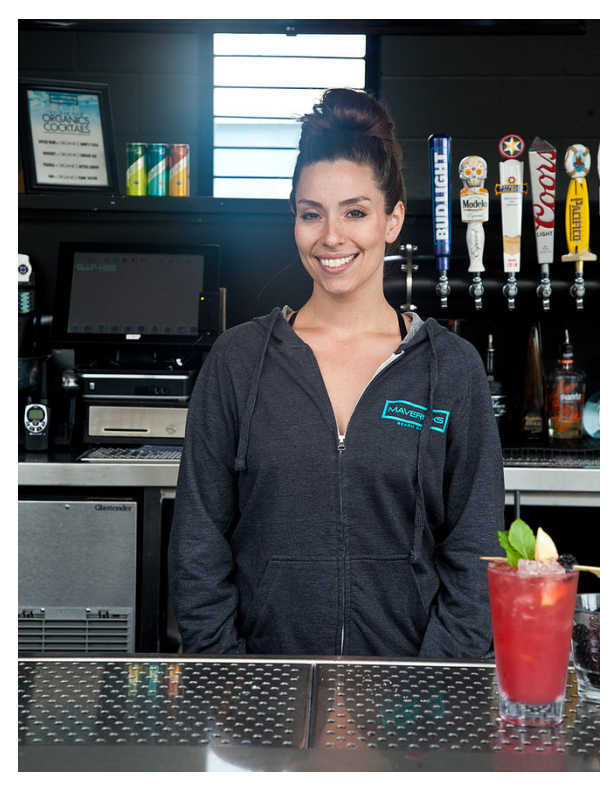
Are you from San Diego?

No, I grew up in Santa Clarita but came to SD to go to school at SDSU! I have been here for 11 years now and it's definitely home.